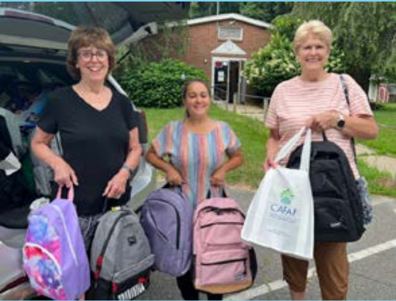
Region 2 had a back-to-school event August 20th. We gave away backpacks filled with school supplies, had balloon magic, face painting, lunch and ice cream from local small businesses and food trucks.