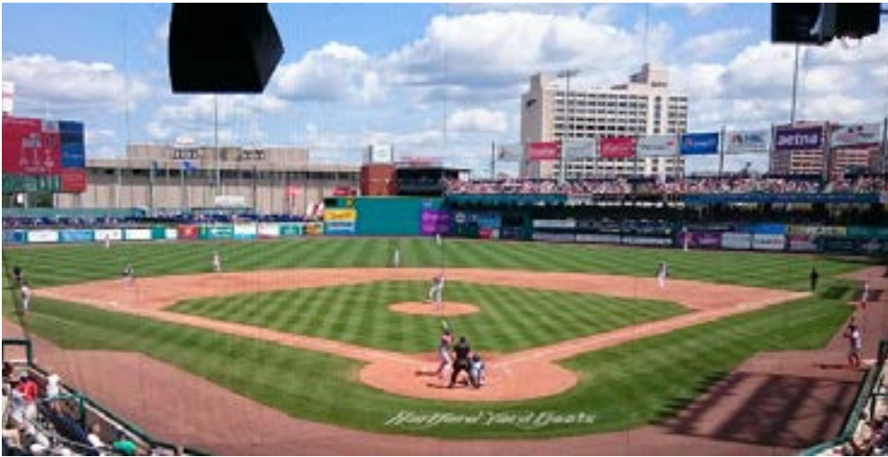
We would like to give a shoutout to the Hartford Yard Goats as they finish up their 2022 season. Our families enjoyed going out to catch a game and had a wonderful time!